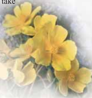
Common rock-rose. Laurie Campbell

Difficulty level is easy to medium with several stiles and some boggy sections.