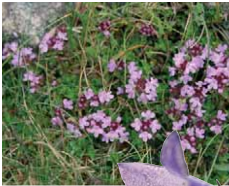
Above: Wild thyme. Mary Sykes

The most common wildflower species is purple wild thyme – the perfume can be overpowering in summer. In the spring early-purple orchids make colour splashes across the grasslands.