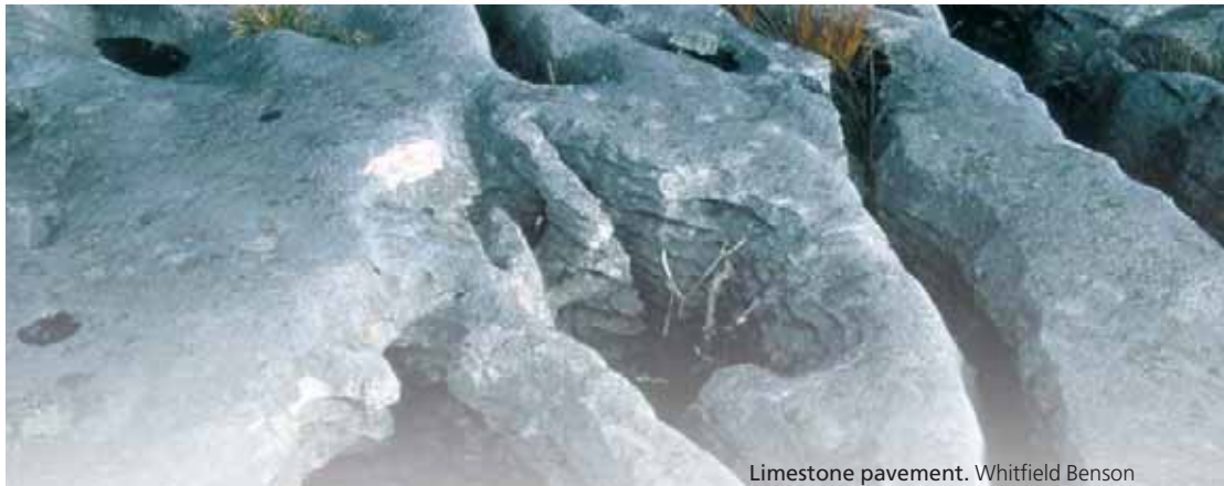
Limestone pavement.