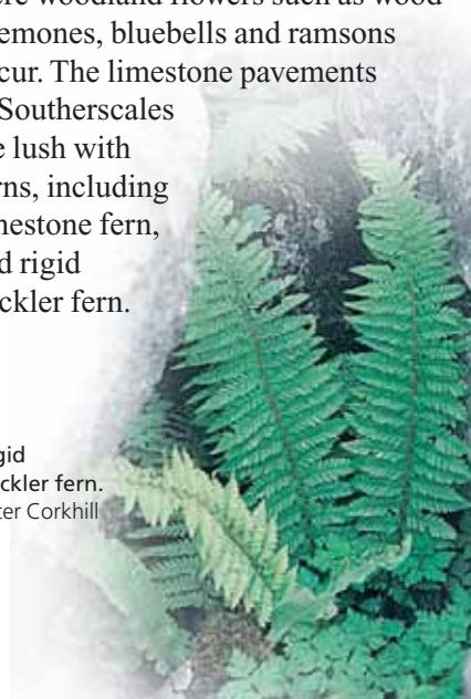
Rigid buckler fern. Peter Corkhill

Here woodland flowers such as wood anemones, bluebells and ramsons occur. The limestone pavements are lush with ferns, including limestone fern, and rigid buckler fern.