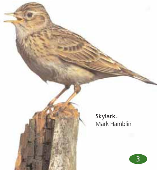
Skylark. Mark Hamblin

3 Just past Braithwaite Wife Hole cross the stile. Turn left off the main