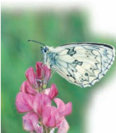
Marbled white.

The oldest features, dating back to Neolithic times some 5,000 years ago, include the causeway camp on the crown of Knap Hill and the long barrow on Walkers Hill, both of which are visible from the car park. The long barrow now called Adam's Grave was once known as Woden's Barrow. Iron Age features include the round barrows which can be seen above the White Horse and near the car park.