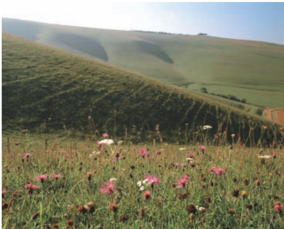
Pewsey Downs landscape. Stephen Davis/Natural England

A section of the Wansdyke crosses the reserve and forms the boundary at its western end. It is also accessible by crossing the road from the car park and following the path to the north.