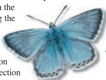
Chalkhill blue.

This huge earthwork was built or enlarged in AD 584 by the Saxon King Ceawhin as protection against the adjacent Saxon kingdom.