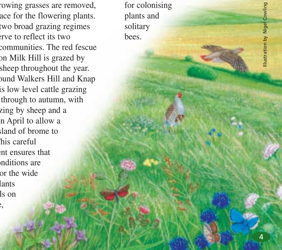
Illustration by Nigel Cowling

Rabbits, moles and badgers use the down and are each important in their own way in creating variety in the sward by digging burrows, scrapes and holes, exposing the soil for colonising plants and solitary bees.